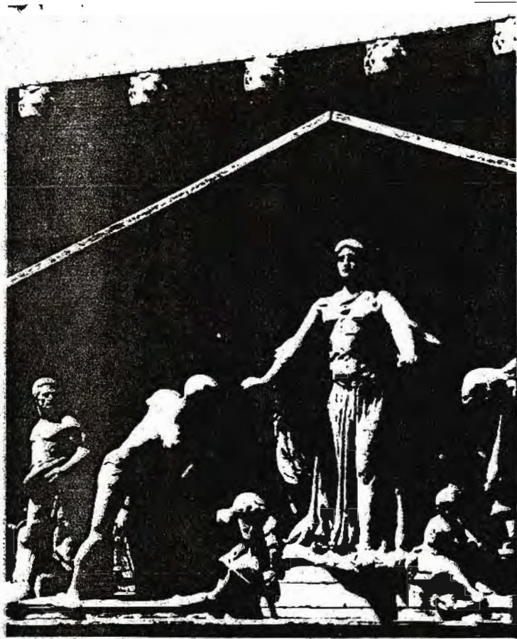
New York Stock Exchange Building facade details